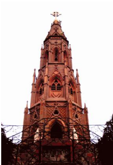
Figure 6.1 Ajit Garh

There has been an ancient practice for reminding an important event or experience where cairns were used as memory aids. A heap of stones piled up in a conical form is known as cairn. An event was recorded by the people who already knew the event by gathering stones in a pile to serve as a reminder of the event for the tribe. Memorial cairns, time and again, have been erected, for instance, the Ajit Garh in North Delhi erected by the British in the memory of the soldiers died during First Indian Independence Movement, 1857. Buddha Stupa and Taj Mahal also serve the purpose of reminders. Even in modern times cairns are often erected as landmarks or as reminder monuments.