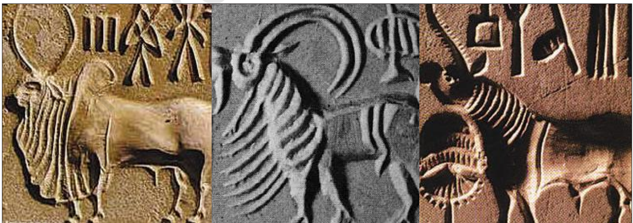
Figure 6.2 Bull Seals

As the most important characteristic of graphic art is considered to be the momentum of reproducing identical copies by means of mechanical process of taking impression, or printing. This explanation may be extended to include all those pre-industrial impressions, which are represented by