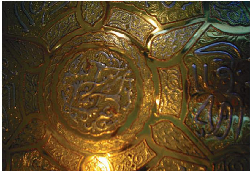
Figure 6.5 A metal inscription

In India, the earliest concept of the book was as a collection of leaves or sheets of bark strung together between covers by a cord. Similarly all the manuscripts from south India have their texts written on leaves through incision with an iron stylus. After inscribing, the leaves were usually smeared with carbon based ink and then cleaned with sand, leaving the ink in the incised letters, which otherwise would have been almost invisible. As it was difficult to write directly on to the leaves of the palmyra, the method of inscribing became the only one used in southern India after its widespread adoption as the normal writing on palm leaf.