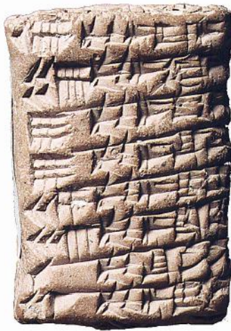
Figure 6.6 Cuneiform writing

The smiths copied not only the letters but also the shapes of the original. The text was incised parallel to the long side. Usually several sheets were required to complete the text, and these were usually in pothi (book) format. They were then strung through a hole to which a royal bronze seal that was cast from a mould could be affixed. Some dynasties of northern India preferred to issue grants in large single sheets with the seal welded or riveted on. They were usually of same type kept in secure storage, but buried at the boundaries of the granted land. They were especially important as the only permanent records of land holdings and were frequently altered by beating out the important details and recarving; and in later centuries entirely spurious grants are commonplace. China, Japan, and Korea have employed the phonetic forms of writing for more than 2000 years. Even today their prints, made in many colours from carved cherry woodblocks, are excellent examples.