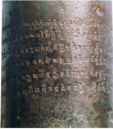
Figure 6.3 Inscription on Ashoka Pillar at Qutab Minar

the relief prints (taking impression from raised surface). These were printed from seals, coins, and larger mould cast surfaces specifically invented for this purpose. This mould casts were used in the earliest Indian civilisation, especially in the Indus Valley at Mohenjo-Daro and Harappa. Later, the alphabetical signs were segregated more and more from the pictures.