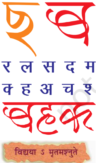
Figure 6.4 Indian alphabet

The sound symbols thereafter became more and more simpler in form. The changing characters slowly led towards the development of a complete set of sound symbols (phonetic symbols) which are now called the alphabet.