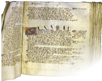
Figure 6.8 Latin calligraphic inscription