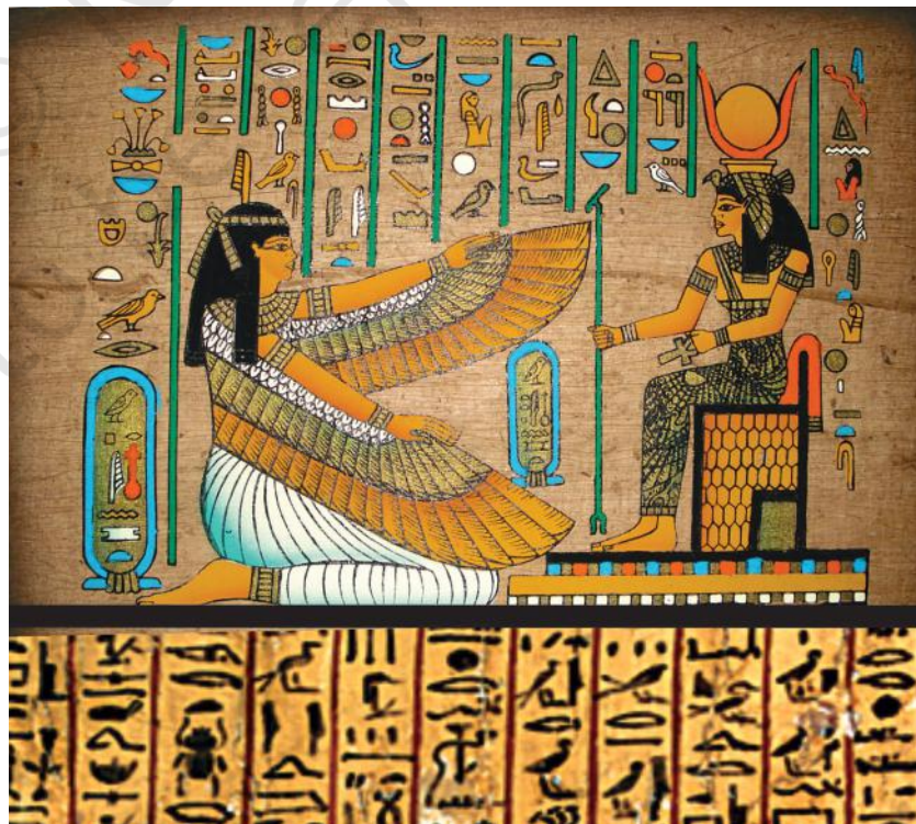
Figure 6.7 Hieroglyphics writing

While the art of printing and paper making was quite advanced in China, the people of middle-East were inscribing their records on stone and clay with characters known as cuneiform writing. The Chaldeans are credited with having been the originators of cuneiform writing in Egypt.