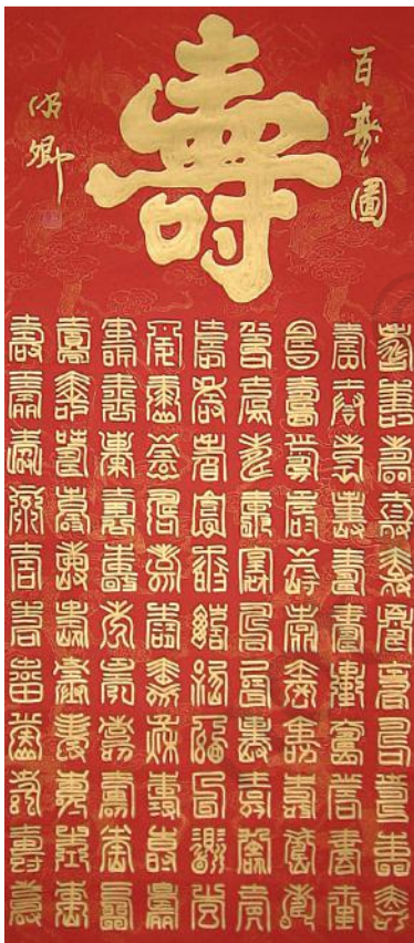
Figure 6.9 Chinese calligraphic writing

The splendid examples of cuneiform writing on clay tablets and clay stamps were first found in Mesopotamia. Cuneiform writing was inscribed on clay tablets and cylinders and on the great monuments of Assyria and Babylon. Since all these countries lie in the Middle-East, it is possible that the Chaldeans, Assyrians, and Babylonians got their ideas from the Chinese. Clay tablets, being lighter than stones, were easier to work with and easier to store and move. The inscriptions were made by wedge-shaped tools, or styli, from which the tablets acquired its name 'cuneiform' which means wedge shaped.