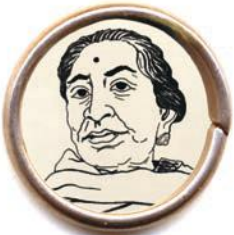
Sarojini Naidu (1879-1949) born: Andhra Pradesh. Poet, writer and political activist. Among the foremost women leaders in the Congress. Later: Governor of Uttar Pradesh.