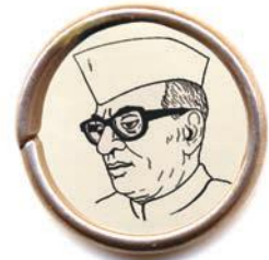
Kanhaiyalal Maniklal Munshi

Constituent Assembly at the stroke of midnight on 15 August 1947: