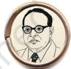
Bhimrao Ramji Ambedkar

(1887-1971) born: Gujarat. Advocate, historian and linguist. Congress leader and Gandhian. Later: Minister in the Union Cabinet. Founder of the Swatantra Party.