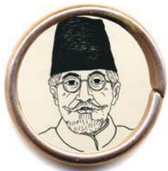
Abul Kalam Azad

(1888-1958) born: Saudi Arabia. Educationist, author and theologian; scholar of Arabic. Congress leader, active in the national movement. Opposed Muslim separatist politics. Later: Education Minister in the first union cabinet.