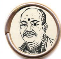
Shyama Prasad Mukherjee

(1891-1956) born: Madhya Pradesh. Chairman of the Drafting Committee. Social revolutionary thinker and agitator against caste divisions and caste based inequalities. Later: Law minister in the first cabinet of post-independence India. Founder of Republican Party of India.