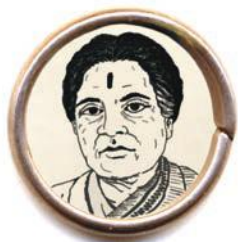
G. Durgabai Deshmukh (1909-1981)

born: Andhra Pradesh. Advocate and public activist for women's emancipation. Founder of Andhra Mahila Sabha. Congress leader. Later: Founder Chairperson of Central Social Welfare Board.