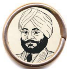
Baldev Singh (1901-1961)

born: Haryana. A successful entrepreneur and leader of the Panthic Akali Party in the Punjab Assembly. A nominee of the Congress in the Constituent Assembly. Later: Defence Minister in the Union Cabinet.