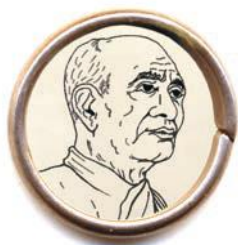
Vallabhbhai Jhaverbhai Patel

(1875-1950) born: Gujarat. Minister of Home, Information and Broadcasting in the Interim Government. Lawyer and leader of Bardoli peasant satyagraha. Played a decisive role in the integration of the Indian princely states. Later: Deputy Prime Minister.