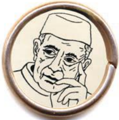
Jawaharlal Nehru (1889-1964) born: Uttar Pradesh. Prime Minister of the interim government. Lawyer and Congress leader. Advocate of socialism, democracy and anti-imperialism. Later: First Prime Minister of India.