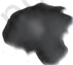
Fig. 3.3: Coal tar

It is a black, thick liquid (Fig. 3.3) with an unpleasant smell. It is a mixture of