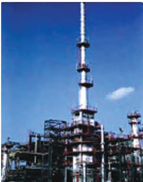
Fig. 3.5: A petroleum refinery

separating the various constituents/ fractions of petroleum is known as refining. It is carried out in a petroleum refinery (Fig. 3.5).