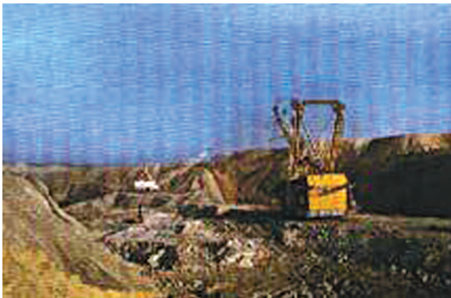
Fig. 3.2: A coal mine

When heated in air, coal burns and produces mainly carbon dioxide gas.