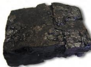
Fig. 3.1: Coal

You may have seen coal or heard about it (Fig. 3.1). It is as hard as stone and is black in colour.