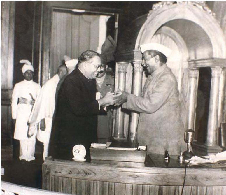
Fig. 12. 9 B. R. Ambedkar and Rajendra Prasad greeting each other at the time of the handing over of the Constitution

The Constituent Assembly debates help us understand the many conflicting voices that had to be negotiated in framing the Constitution, and the many demands that were articulated. They tell us about the ideals that were invoked and the principles that the makers of the Constitution operated with. But in reading these debates we need to be aware that the ideals invoked were very often re-worked according to what seemed appropriate within a context. At times the members of the Assembly also changed their ideas as the debate unfolded over three years. Hearing others argue, some members rethought their positions, opening their minds to contrary views, while others changed their views in reaction to the events around.