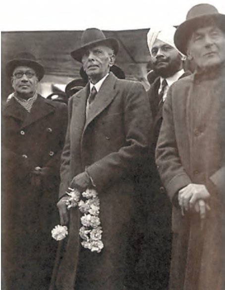
Fig. 12.8 In the winter of 1946 Indian leaders went to London for what turned out to be a fruitless round of talks with British Prime Minister Attlee. (Left to right: Liaquat Ali, Mohammad Ali Jinnah, Baldev Singh and Pethick-Lawrence)