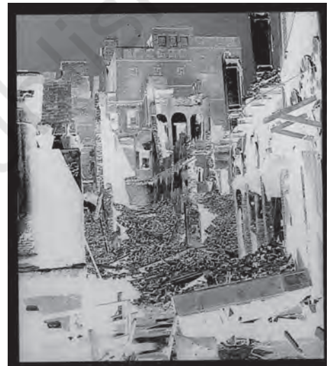
Fig. 12.2 Images of desolation and destruction continued to haunt members of the Constituent Assembly.

On Independence Day, 15 August 1947, there was an outburst of joy and hope, unforgettable for those who lived through that time. But innumerable Muslims in India, and Hindus and Sikhs in Pakistan, were now faced with a cruel choice – the threat of