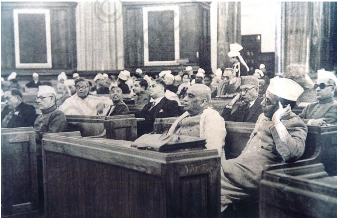
Fig. 12.4 The Constituent Assembly in session Sardar Vallabh Bhai Patel is seen sitting second from right.

The discussions within the Constituent Assembly were also influenced by the opinions expressed by the public. As the deliberations continued, the arguments were reported in newspapers, and the proposals were publicly debated. Criticisms and