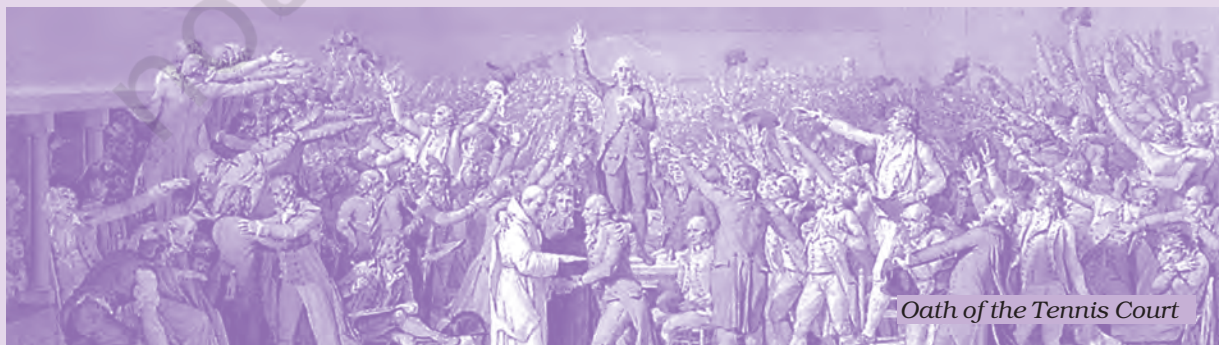
Oath of the Tennis Court

CONSTITUENT ASSEMBLY DEBATES (CAD), VOL.I