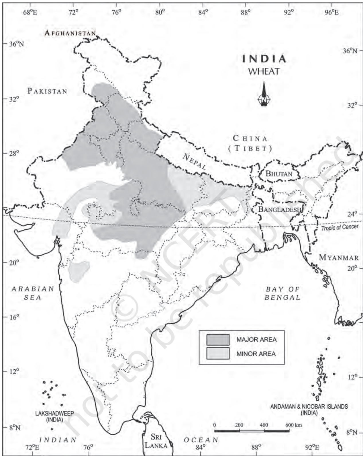
Fig. 3.4 : India – Distribution of Wheat