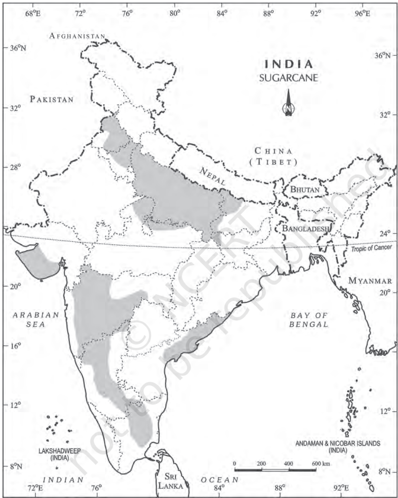
Fig. 3.9 : India - Distribution of Sugarcane