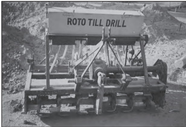
Fig. 3.12 : Roto Till Drill—A modern agricultural equipment