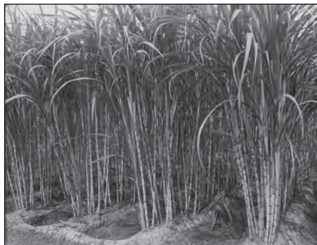
Fig. 3.8 : Sugarcane Cultivation

Sugarcane is a crop of tropical areas. Under rainfed conditions, it is cultivated in sub-humid and humid climates. But it is largely an irrigated crop in India. In Indo-Gangetic plain, its cultivation is largely concentrated in Uttar Pradesh. Sugarcane growing area in western India is spread over Maharashtra and Gujarat.