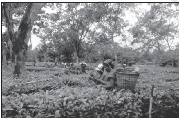
Fig. 3.10 : Tea Farming

Tea is a plantation crop used as beverage. Black tea leaves are fermented whereas green tea leaves are unfermented. Tea leaves have rich content of caffeine and tannin. It is an indigenous crop of hills in northern China. It is grown over undulating topography of hilly areas and well-drained soils in humid and sub-humid tropics and sub-tropics. In India, tea plantation started in 1840s in Brahmaputra valley of Assam which still is a major tea growing area in the country. Later on, its plantation was introduced in the sub-Himalayan region of West Bengal (Darjeeling, Jalpaiguri and Cooch Behar districts). Tea is also cultivated on the lower slopes of Nilgiri and