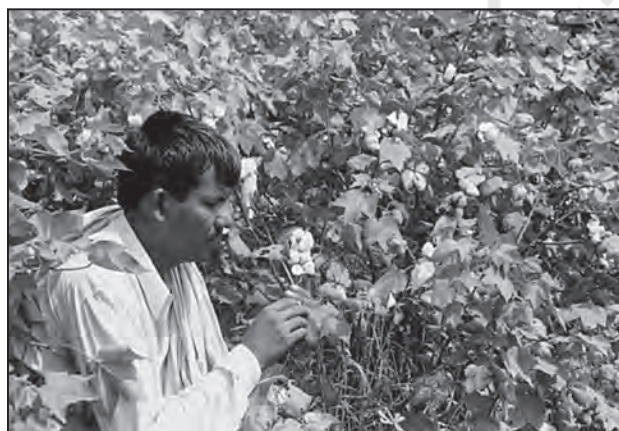
Fig. 3.7 : Cotton Cultivation

Cotton is a tropical crop grown in kharif season in semi-arid areas of the country. India lost a large proportion of cotton growing area to Pakistan during partition. However, its acreage has increased considerably during the last 50 years. India grows both short staple (Indian) cotton as well as long staple (American) cotton called ' narva ' in north-western parts of the country. Cotton requires clear sky during flowering stage.