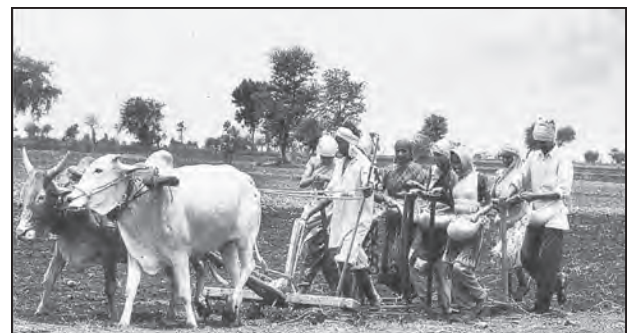
Fig. 3.5 : Farmers sowing soyabean seeds in Amravati, Maharashtra

Soyabean and sunflower are other important oilseeds grown in India. Soyabean is mostly grown in Madhya Pradesh and Maharashtra.