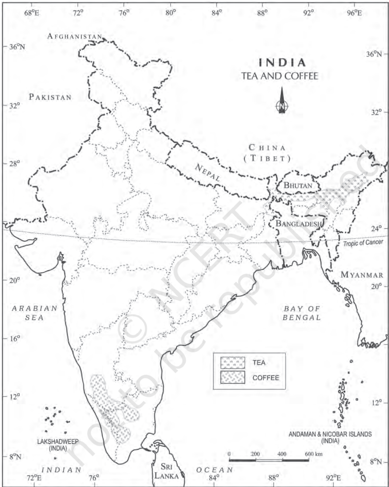
Fig. 3.11 : India - Distribution of Tea and Coffee