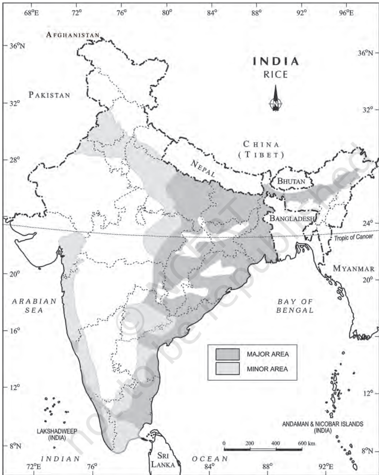
Fig. 3.3 : India – Distribution of Rice