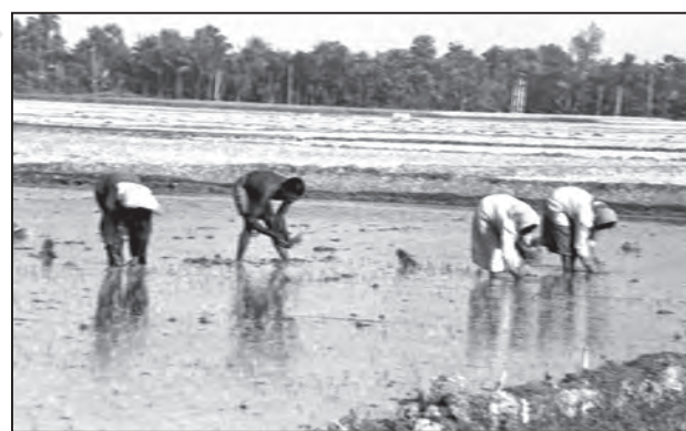
Fig. 3.2 : Rice transplantation in southern parts of India

India contributes 22.07 per cent of rice production in the world and ranked second after China in 2018. About one-fourth of the total cropped area in the country is under rice cultivation. West Bengal, Uttar Pradesh, and Punjab are the leading rice producing states in the country. The yield level of rice is high in Punjab, Tamil Nadu, Haryana, Andhra Pradesh, Telangana, West Bengal and Kerala. In the first four of these states almost the entire land under rice cultivation is irrigated. Punjab and Haryana are not traditional rice growing areas. Rice