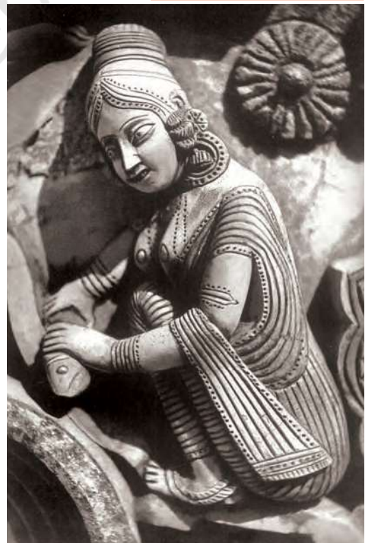
Fig. 14 Fish being dressed for domestic consumption, terracotta plaque from the Vishalakshi temple, Arambagh.

Brahmanas were not allowed to eat non-vegetarian food, but the popularity of fish in the local diet made the Brahmanical authorities relax this prohibition for the Bengal Brahmanas. The Brihaddharma Purana , a thirteenth-century Sanskrit text from Bengal, permitted the local Brahmanas to eat certain varieties of fish.