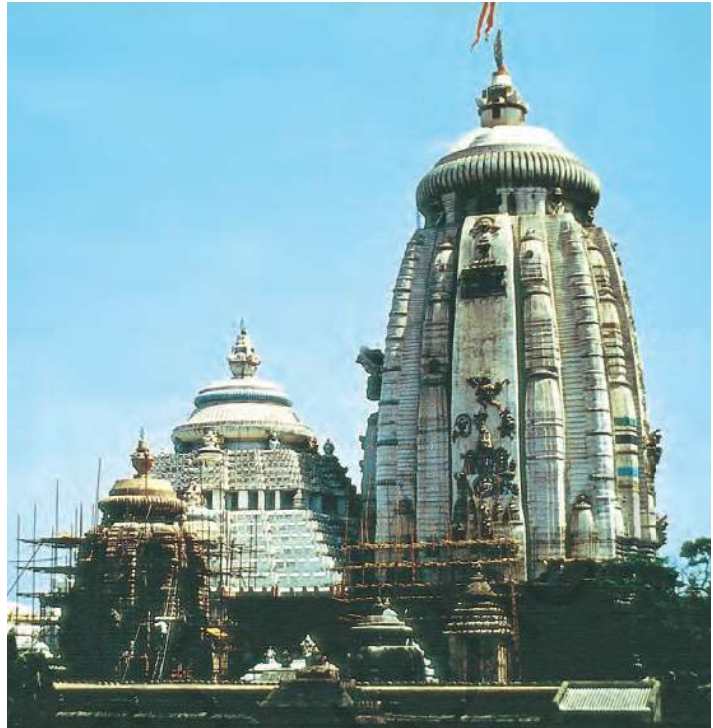
Fig. 3 Jagannatha temple, Puri.

These cultural traditions were closely linked with the ideals and aspirations of rulers. From about the eighth century, most of the present-day state of Rajasthan was ruled by various Rajput families. Prithviraj (Chapter 2) was one such ruler. These rulers cherished the ideal of the hero who fought valiantly, often choosing death on the battlefield rather than face defeat. Stories about Rajput heroes were recorded in poems and songs, which were recited by specially trained minstrels.