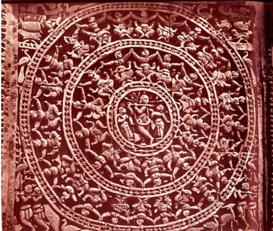
Fig. 13 Krishna with gopis, terracotta plaque from the Shyamaraya temple, Vishnupur.