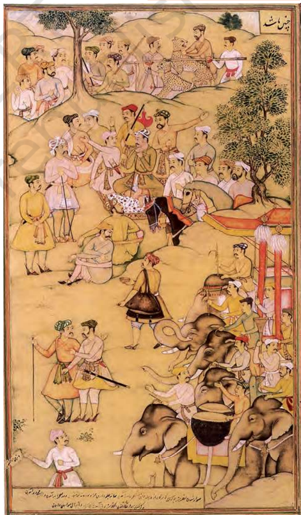
Fig. 7 Akbar resting during a hunt, Mughal miniature.

Another region that attracted miniature paintings was the Himalayan foothills around the modern-day state of Himachal Pradesh. By the late seventeenth