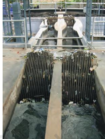
Fig. 13.3 Bar screen