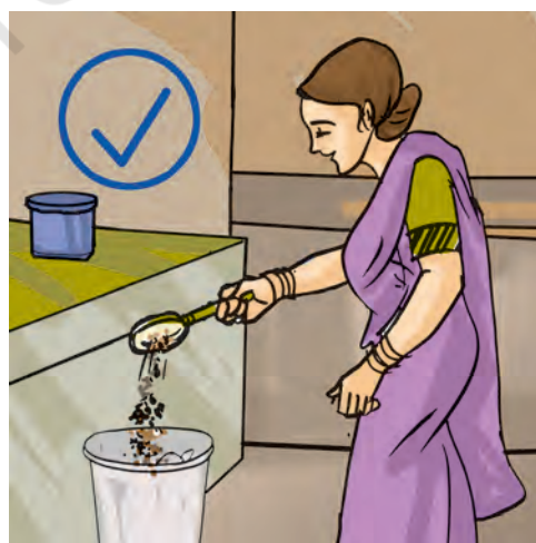
Fig. 13.7 Do not throw everything in the sink