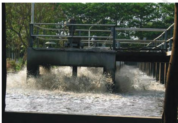
Fig. 13.6 Aerator

4. Air is pumped into the clarified water to help aerobic bacteria to grow. Bacteria consume human waste, food waste, soaps and other unwanted matter still remaining in clarified water (Fig. 13.6).