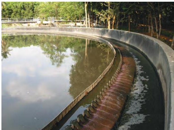
Fig. 13.5 Water clarifier

a scraper. This is the sludge . A skimmer removes the floatable solids like oil and grease. Water so cleared is called clarified water (Fig. 13.5).