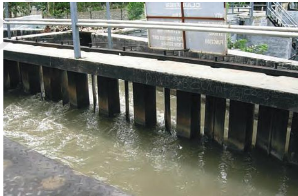
Fig. 13.4 Grit and sand removal tank